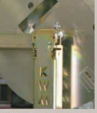
New upright, tension brake, aluminum spool and coil scale