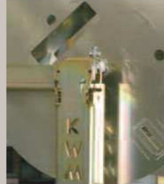
New upright, tension brake, aluminum spool and coil scale