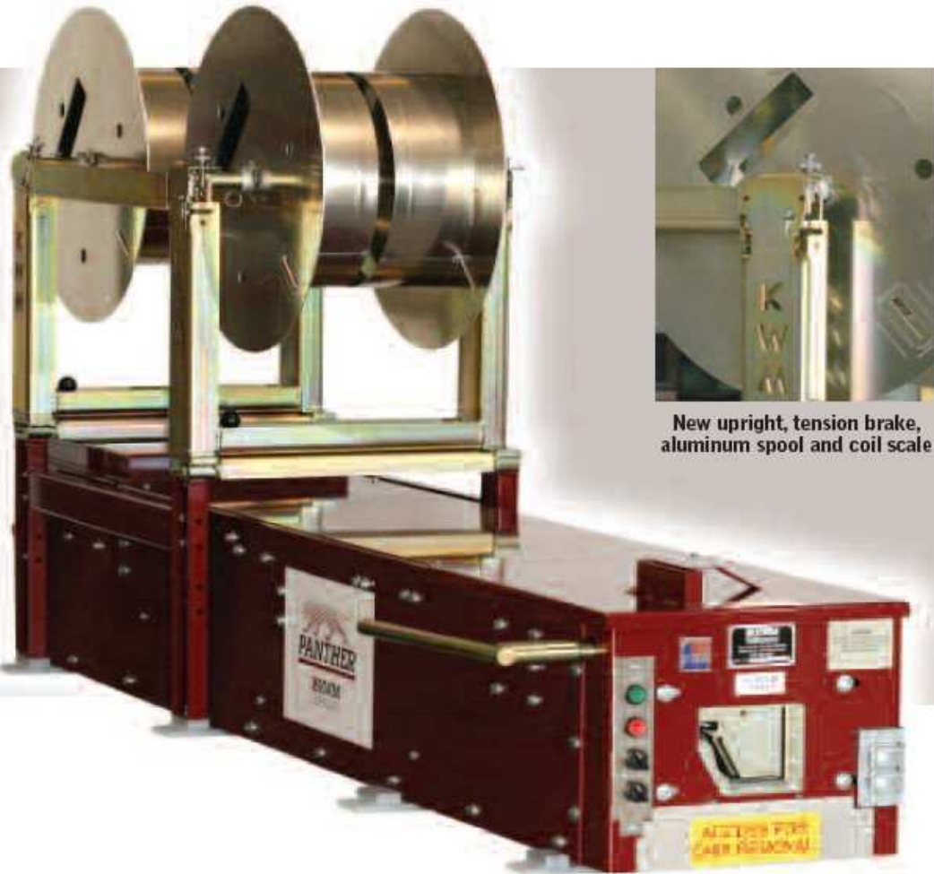
New upright, tension brake, aluminum spool and coil scale