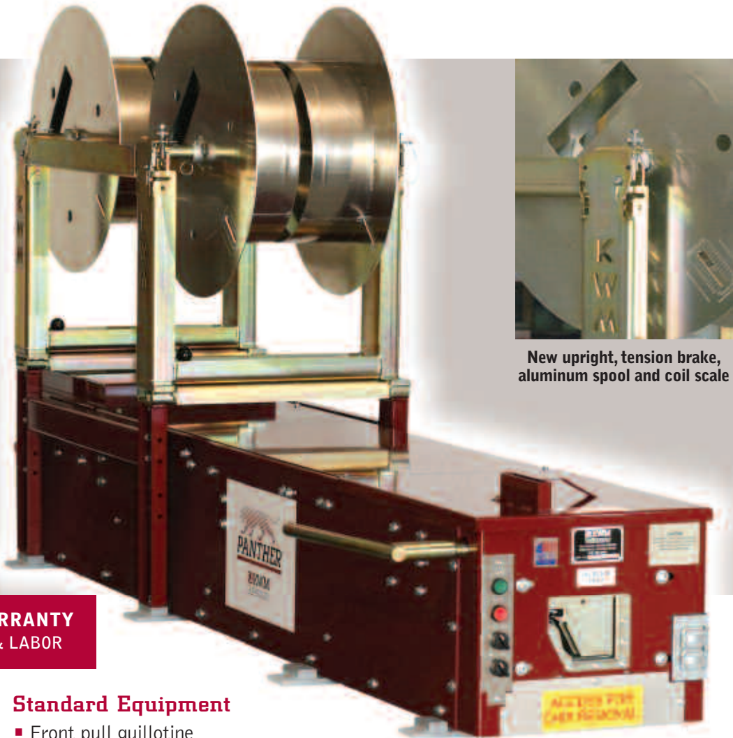
New upright, tension brake, aluminum spool and coil scale