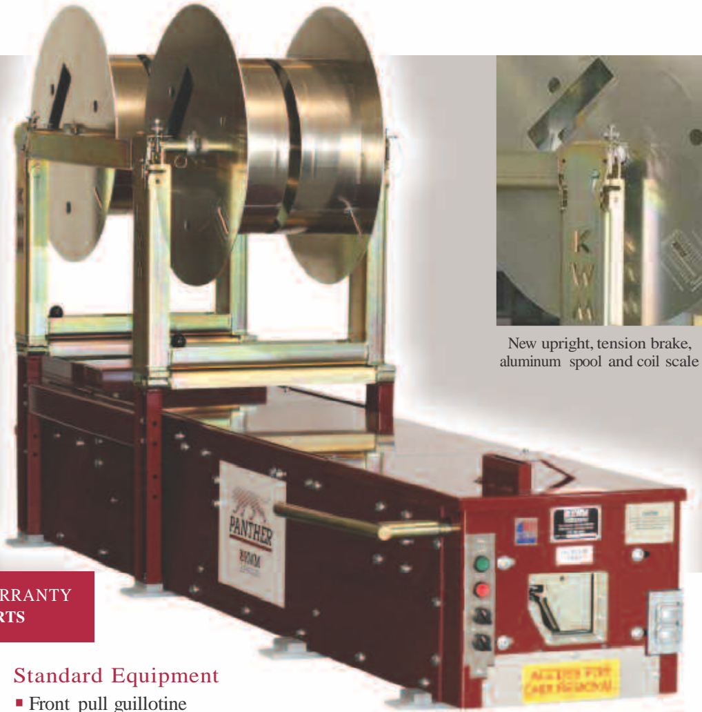
New upright, tension brake, aluminum spool and coil scale