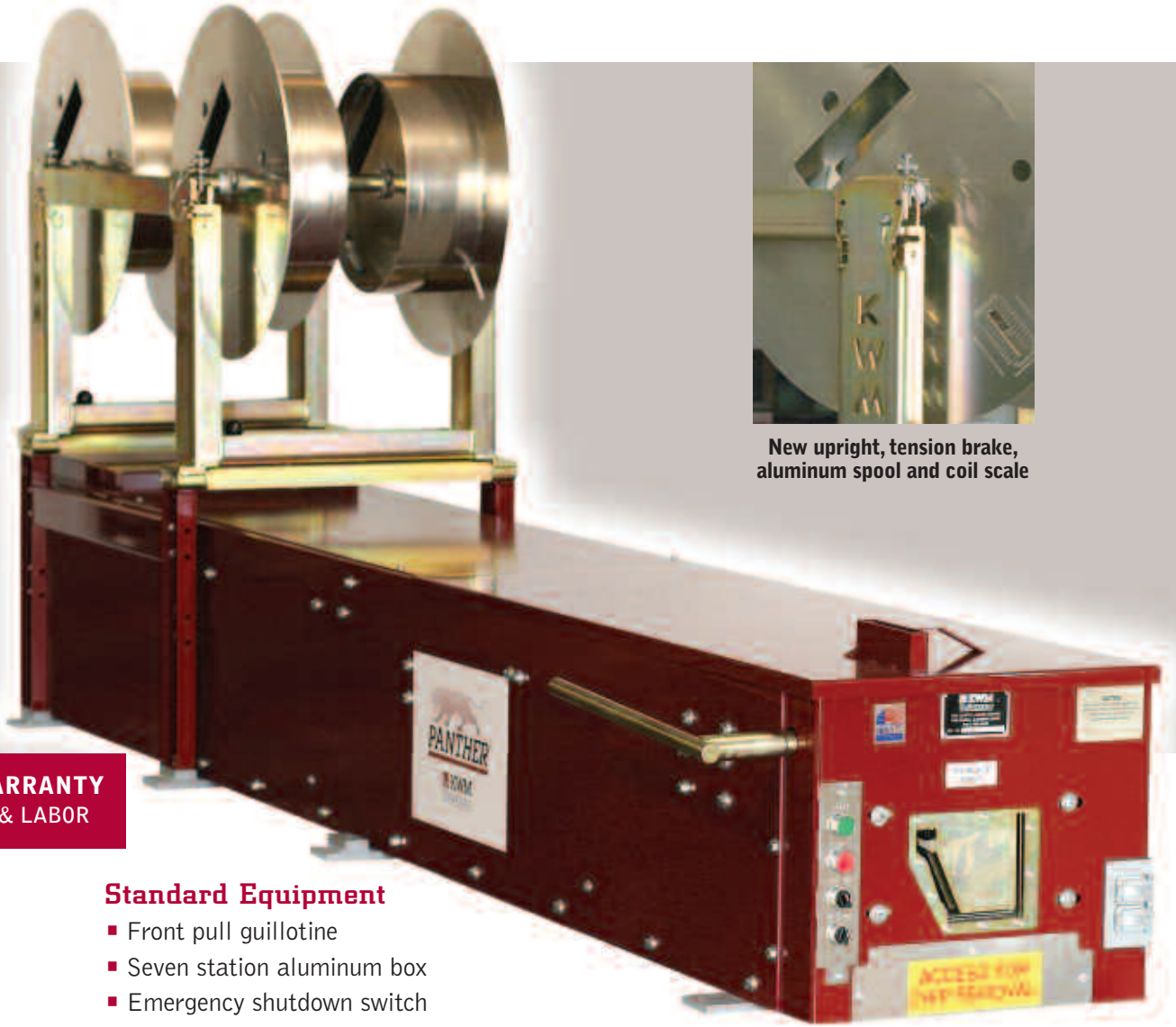
New upright, tension brake, aluminum spool and coil scale