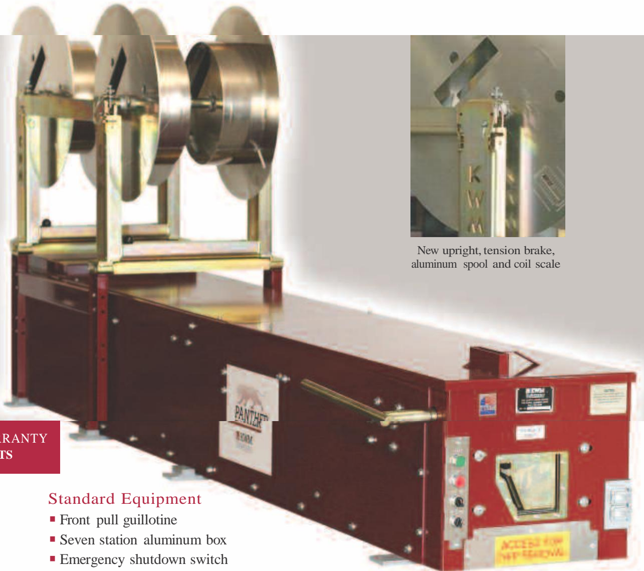
New upright, tension brake, aluminum spool and coil scale