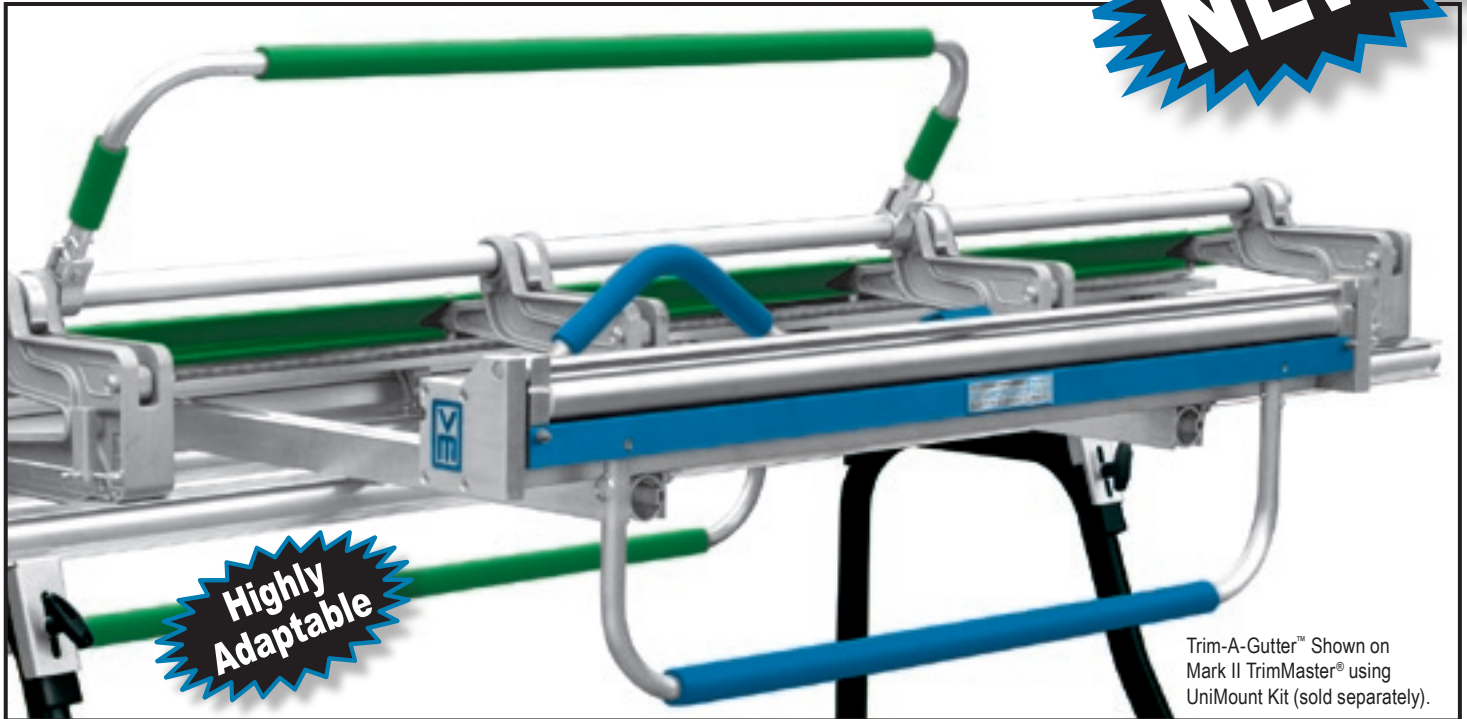
Trim-A-Gutter™ Shown on Mark II TrimMaster® using UniMount Kit (sold separately).