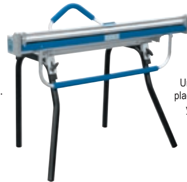
UniMount™ Kit lets you place Trim-A-Gutter™ on your Van Mark brake, or mount independently using optional UniLeg™ supports (sold separately)