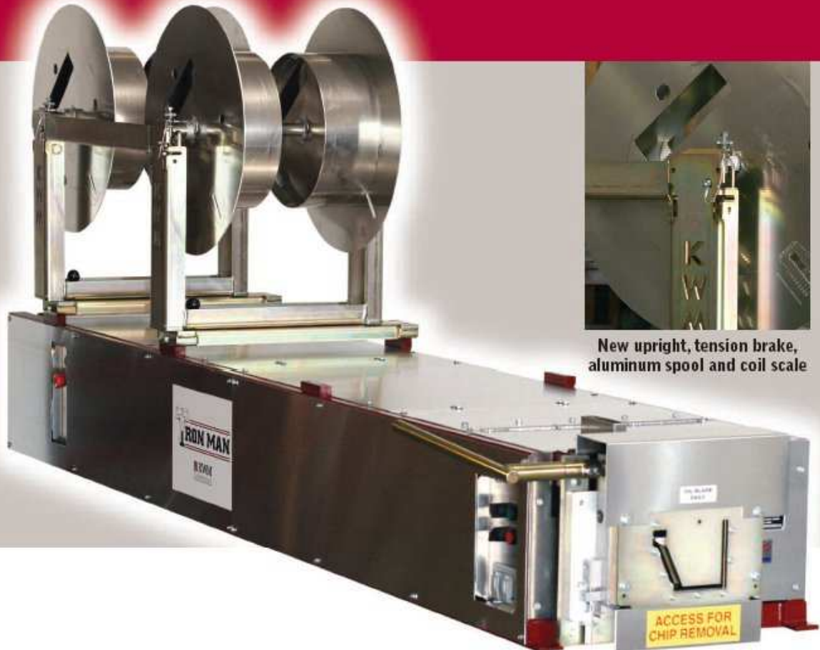
New upright, tension brake, aluminum spool and coil scale