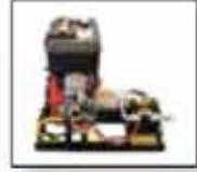
Quick Change Power Pac™