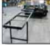
Run Out Table