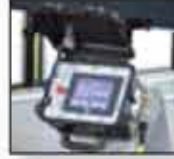
PLC Computer Controller