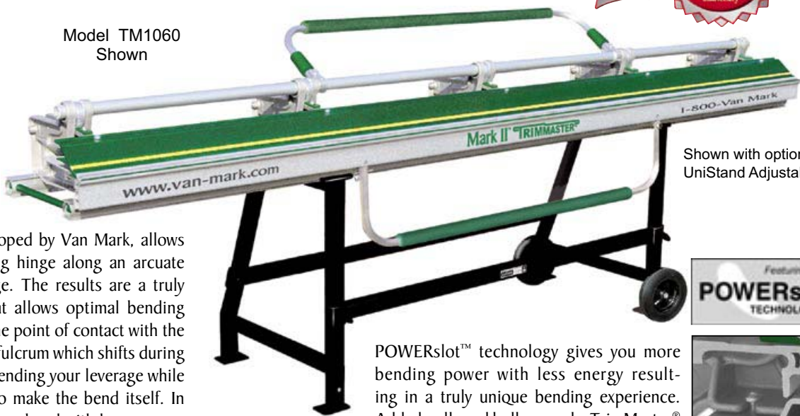
Shown with optional UniStand Adjustable™