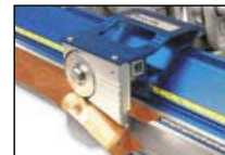
Optional TrimCutter™ does not ride off brake!