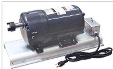
NEW! HD Motor #3535

Contact us today to find out how the Trim-A-Slitter™ Industrial Series can increase your productivity and profits.