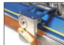
Optional TrimCutter™ does not ride off brake!