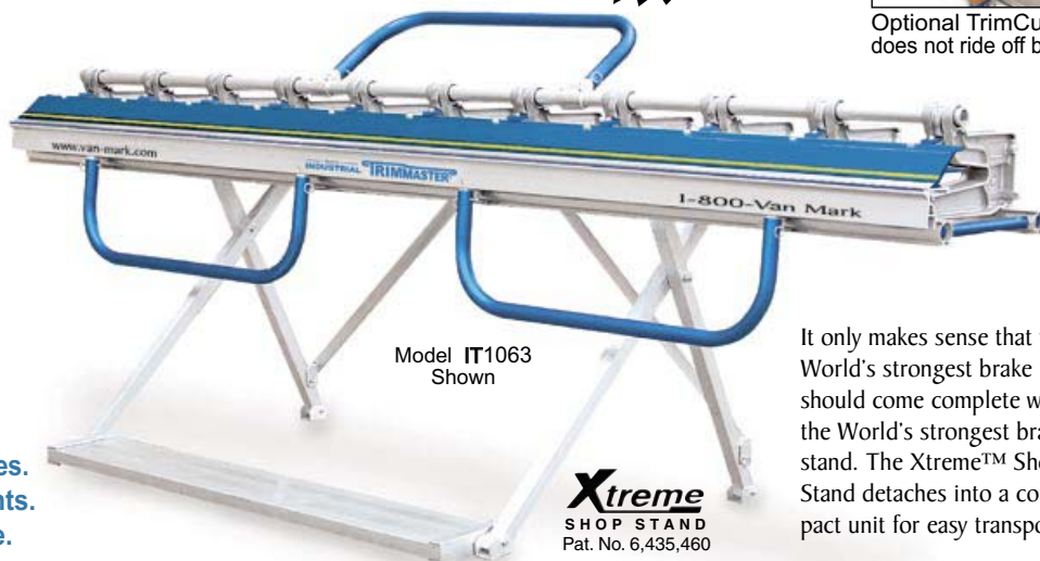
Model IT1063 Shown

It only makes sense that the World's strongest brake should come complete with the World's strongest brake stand. The Xtreme™ Shop Stand attaches into a compact unit for easy transport.