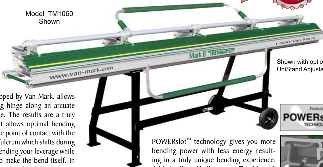
Shown with optional UniStand Adjustable™